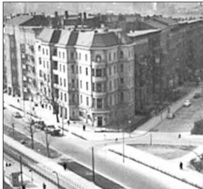
1961: no trees at the Yorkschlösschen