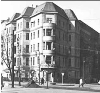
War damages: turret and stucco are gone