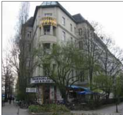
Revegetated jazz tavern with beer garden