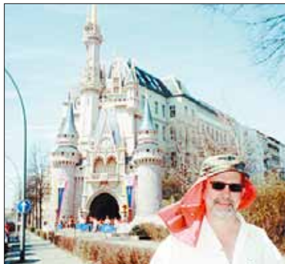
New front after rebuilding