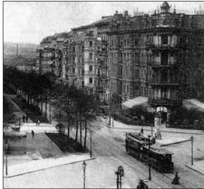
Yorkschrösschen with front garden ca. 1900